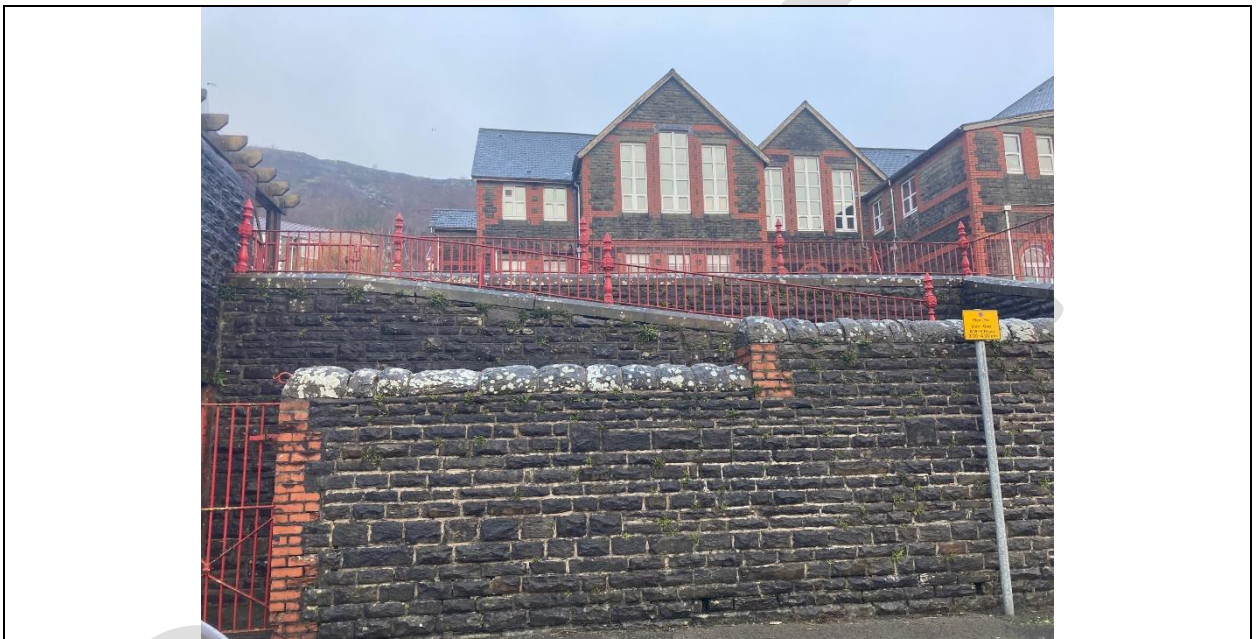
The view of the existing school building from Darran Terrace.

YGG Llyn y Forwyn is a Welsh medium community school located at Darran Terrace, Ferndale. The school site consists of a traditional stone Victorian School building. According to the condition survey of the school carried out by the Council in 2019, YGG Llyn y Forwyn is graded D for condition and C for suitability, where A is the highest and D is the lowest performing building respectively. It is acknowledged that this is the worst school in the Council's education portfolio in terms of condition and suitability.